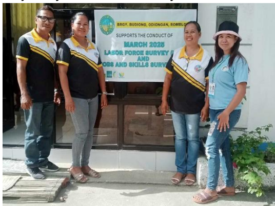
BLGU Budiong showing support on March 2025 LFS/JSS.

Meanwhile, the Jobs and Skills Survey (JSS), a rider survey to the March 2025 LFS, is jointly undertaken by the PSA and the Asian Development Bank (ADB). It is a nationwide survey which aims to collect critical data on employment, skills, and labor conditions which will enhance the understanding of national and regional labor markets, contributing to a more informed and effective policy intervention. The data from the JSS will provide valuable insights to address issues several job quality concerns such as skill mismatches, informal employment, and underemployment and help the government formulate targeted labor and education policies.