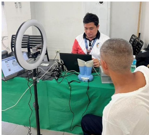
A Looc resident as he registers to National ID.

PSA Romblon catered requests for certified copy issuance of civil registry documents (Birth, Marriage, and Death Certificates) and certification (Negative Certification, CRS Form No. 4 - CENOMAR and facilitated clients with concerns on civil registration documents.