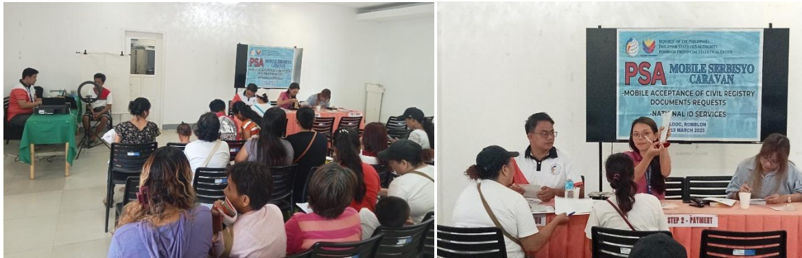
In frame, PSA Romblon as they cater clients requesting for civil registry documents requests.

21 March 2025 - LOOC, ROMBLON. On 19-20 March 2025, the Philippine Statistics Authority-Romblon Provincial Statistical Office engaged in caravan events in the municipality of Looc to commemorate its 151 st Foundation Day. This initiative was made possible through the support of the Local Government Unit (LGU) and the Local Civil Registry Office (LCRO) of Looc.