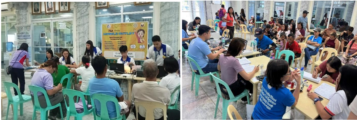
PSA employees as they cater clients requesting for civil registry documents.

21 March 2025 - ROMBLON, ROMBLON. During the celebration of the 124 th Foundation Day and 80 th Liberation Day of the province of Romblon, a series of activities were held with the participation of offices of various agencies, including the Philippine Statistics Authority-Romblon Provincial Statistical Office, with the objective of bringing services closer to Romblomanons.