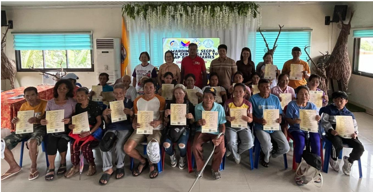
BRAP beneficiaries in Sta. Maria, Romblon proudly displaying the PSA copy of birth certificates

21 March 2025 - STA. MARIA, ROMBLON. The Philippine Statistics Authority-Romblon Provincial Statistical Office, in collaboration with the Local Government Unit of Sta. Maria, successfully distributed thirty (30) Certificate of Live Births in Security Paper (SECPA) under the Birth Registration Assistance Project (BRAP).