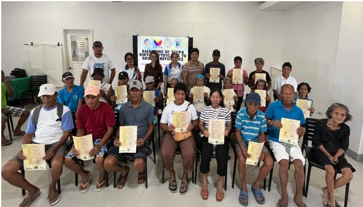
BRAP beneficiaries in Looc, Romblon proudly displaying the PSA copy of their birth certificates.

21 March 2025 - LOOC, ROMBLON. The Philippine Statistics Authority-Romblon awarded free Certificates of Live Birth (COLB) in Security Paper (SECPA) to Birth Registration Assistance Project (PBRAP) beneficiaries in the municipality of Looc, Romblon last 20 March 2025.