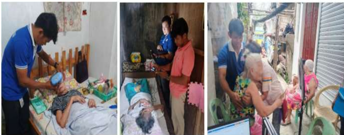
PSA Romblon registration personnel assist elderly and bedridden seniors in Romblon.

28 MAY 2025 – ROMBLON, ROMBLON. The National ID on Wheels program, formerly known as PhilSys on Wheels, is an initiative of the Philippine Statistics Authority designed to bring National ID registration services closer to the public, particularly to individuals in geographically isolated areas, persons with disabilities, and senior citizens.