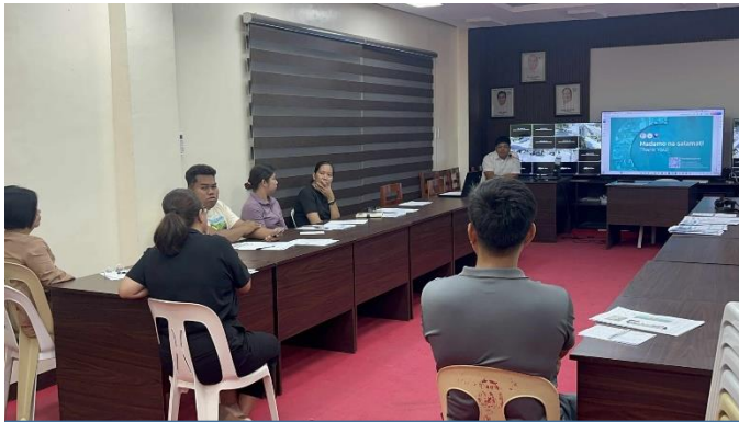
In frame, LGU officials/employees as they raise their concerns/issues during an open forum.

Following the presentation, an open forum was conducted, where participants from the local government, planning officers, and other departments were encouraged to