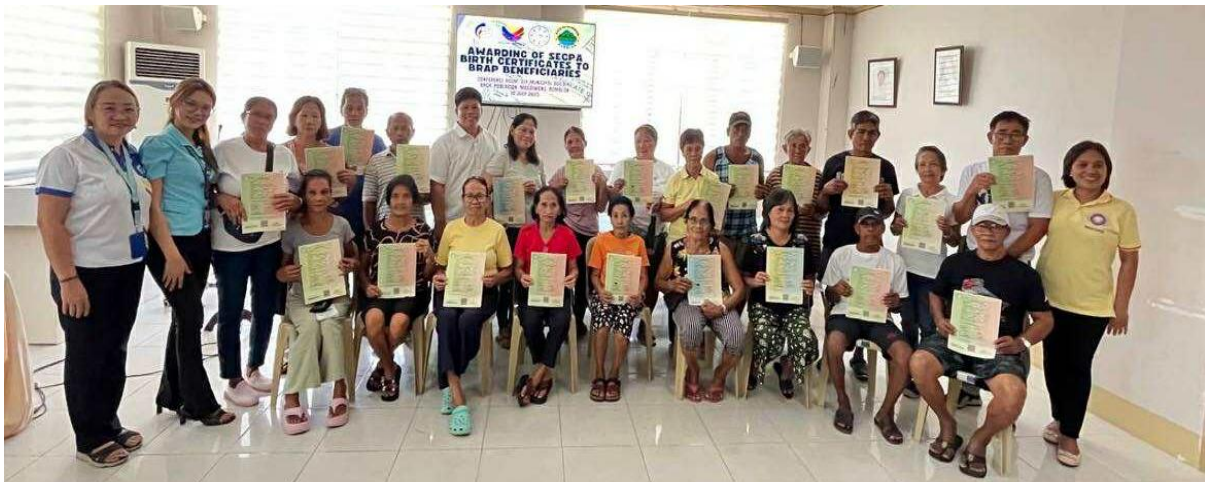
BRAP Beneficiaries, LGU officials/ employees and PSA Romblon employees posed for souvenir photo after the awarding ceremony.

The Local Government of Magdiwang Magdiwang also expressed their continued commitment to the program and their appreciation to PSA and its partners for supporting the people of Magdiwang.