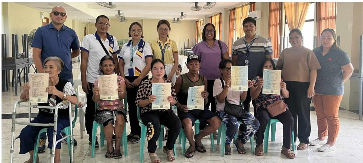
BRAP Beneficiaries, LGU officials/ employees and PSA Romblon employees posed for souvenir photo after the awarding ceremony.

The BRAP aims to promote universal birth registration across the Philippines by assisting individuals who have no existing record of live birth in obtaining their official Security Paper (SECPA) copies of birth certificates.