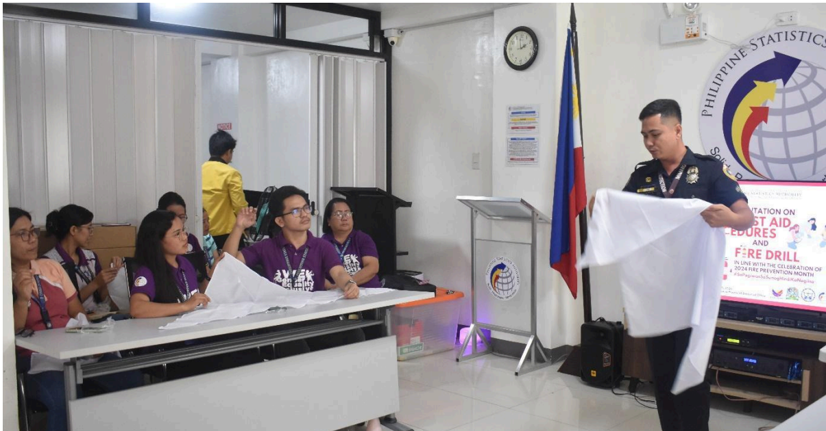
FO 3 Ditan discusses the basics of using a Triangular Bandage (Cravat) in sample emergency scenarios

The Philippine Statistics Authority (PSA) Marinduque Provincial Statistical Office (PSO) recently hosted a Training Orientation on Basic First Aid Procedures and Fire Drill on 15 March 2024. This is in partnership with the Bureau of Fire Protection – Boac, as the BFP leads efforts to prevent fires, investigate their causes, and provide emergency services. The training was conducted to demonstrate PSA-Marinduque PSO's unity with the BFP and the entire nation in observing and promoting fire safety, preparedness, and resilience, especially during the Fire Prevention Month – March. With this training, the office demonstrates its commitment to safeguarding lives and property.