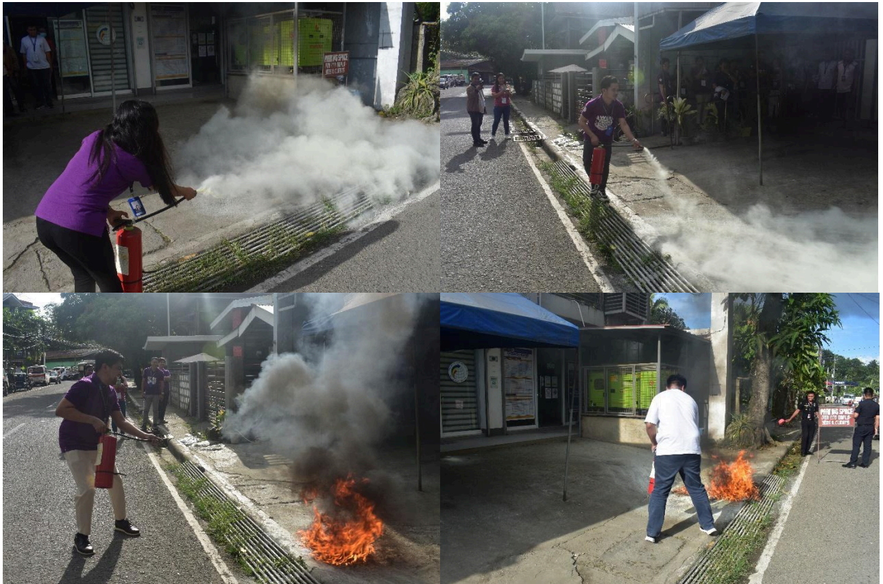
PSA-Marinduque PSO personnel efficiently and actively used a fire extinguisher to extinguish the fire

After the detailed discussions, a fire drill was conducted. Firstly, PSA-Marinduque PSO personnel were blindfolded, and whenever the siren sounded, they had to evacuate from their workstations. This was to ensure and measure the employees' familiarity with the office environment. Then, the actual use of fire extinguishers was demonstrated, and each employee was encouraged to participate in using fire extinguishers and applying the knowledge gained during the discussion to extinguish fires. The training concluded with the employees expressing their aim for more related training.