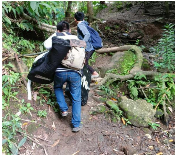
PhilSys Registration Team transferring kit to Purok Kansurok in Brgy, Tugos, Boac.

The initiative has already covered multiple barangays, allowing more Marinduqueños to secure their National IDs. With 206,032 registrants who have completed the Step 2 Registration and 160,919 ePhilIDs issued as of 21 September 2024, the ongoing registration drives are important part of the agency's goal to enroll 92 million Filipinos in the PhilSys program.