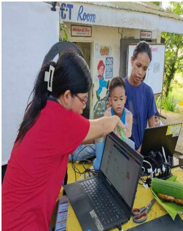
School registration at Agpudlos Elementary School