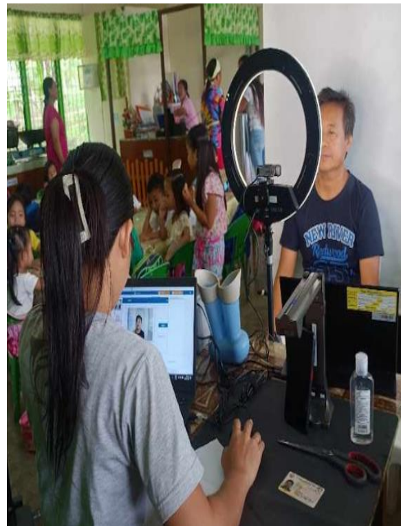
School registration at Ben G. Talamisan Elementary School