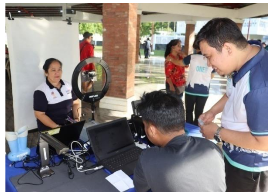
PhilSys Registration during 34<sup>th</sup> CRM Opening Program.

Meanwhile, of the entire number of ePhilIDs issued to Romblomanons, 14.10%, or 29,672, were printed on request or by appointment, while the remaining 85.90%, or 180,718, were printed and given to the proper cardholders by PhilSys teams (Mode 2).