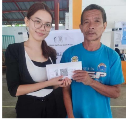
Registrants who received their ePhillDs minutes after registration.

The Philippine Identification System Act, or Republic Act 11055, was signed into law in August 2018. It aims to establish a single national ID for all Filipinos and resident aliens, providing valid proof of identity for Filipino citizens and resident aliens of the Philippines.