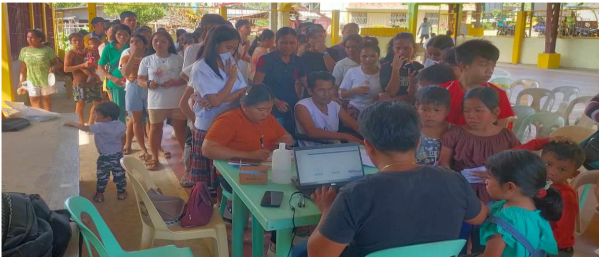
Beneficiaries line up for PhilSys authentication in Brgy. Li-o, Romblon, Romblon.

Last 28 February 2024, 4Ps beneficiaries have started undergoing identity verification through biometric authentication using the PhilSys Authentication Application to avail of the FDS equivalency in the province of Romblon.