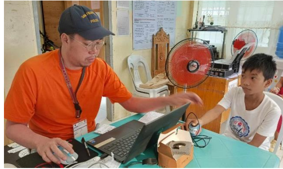
4Ps authentication at Brgy. Calagonsao, Alcantara, Romblon.

Meanwhile, the Fixed Registration Center in Odiongan continues to offer National ID registration, along with services such as updating and correcting demographic information for all applicants. This initiative is designed to make the registration process more accessible and efficient, ensuring that all Filipinos can easily access government services and benefits.