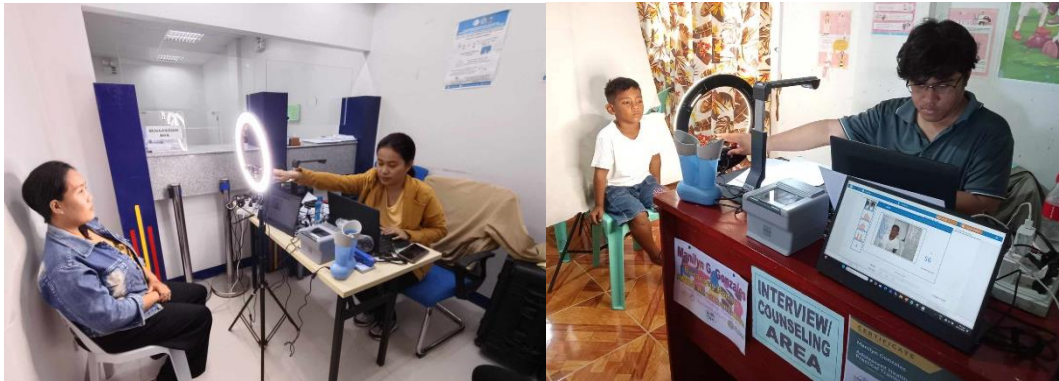
Biometric information capturing during registration at Fixed Registration Center (left photo) and Brgy. Bonlao, Alcantara, Romblon (right photo).

22 JANUARY 2025 – ROMBLON, ROMBLON. The Philippine Statistics Authority Romblon Provincial Statistical Office is continuing its efforts in the National ID registration of more Romblomanons, including children below 5 years old. This initiative is part of the government's effort to ensure that every Filipino, regardless of age, is included in the National ID system. The National ID provides essential access to government services, healthcare, education, and more, ensuring that even the youngest citizens are well-represented.