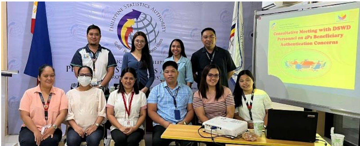
In frame, PSA employees, together with DSWD employees who participated the meeting onsite.

Date Release: 28 January 2025 Reference No.: PR-2025 -011