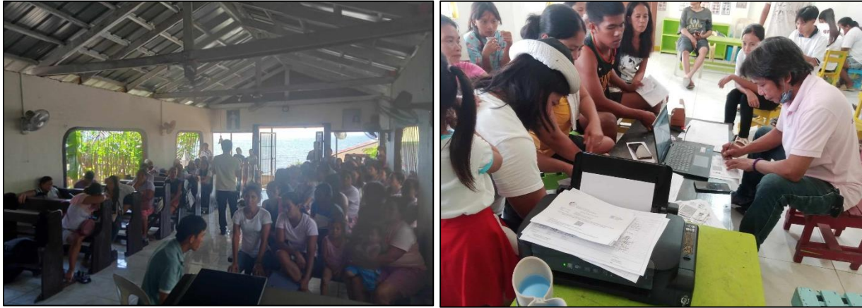
PhilSys Registration Team conducts authentication of PhilIDs/ePhils of DSWD 4Ps Beneficiaries in two FDS co-location sites in Barangay Libas, Buenavista and Barangay Anapog-Sibucan, Mogpog.

As PhilSys continues to expand its implementation, individuals who are not yet registered are encouraged to take the initiative and visit the nearest registration centers to be registered.