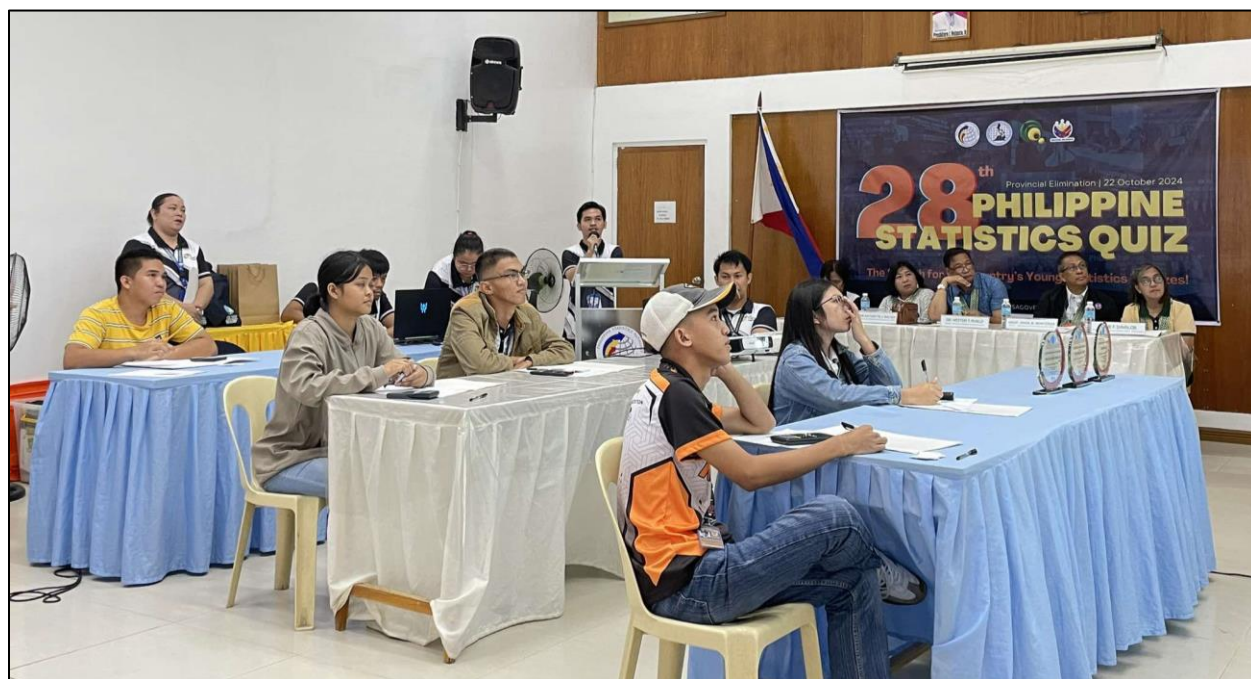
Participants of the 28th PSQ listened attentively as the quizmaster reads the questions.

22 October 2024 –BOAC, MARINDUQUE. The Philippine Statistics Authority (PSA) Marinduque Provincial Statistical Office (PSO) successfully conducted the 28th Philippine Statistics Quiz (PSQ) Provincial Elimination on 22 October 2024, despite the adverse weather conditions caused by tropical cyclone “Kristine.” Originally slated to take place at the AVR Hall of Marinduque State University (MarSU), the event was relocated to the LMD-PESO Hall at the Provincial Capitol due to the suspension of classes and work at MarSU, ensuring the safety of participants and guests.