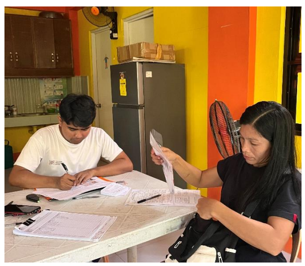
PhilSys Registration Team conducts ePhilID distribution and authentication of ePhilIDs/PhilIDs for DSWD 4Ps Beneficiaries.

14 June 2024 – BARANGAY BAYUTI, BOAC, MARINDUQUE. Philippine Statistics Authority (PSA) Marinduque Provincial Statistical Office (PSO) reiterates its commitment to inclusivity, as it diligently works to facilitate registrations for the Philippine Identification System (PhilSys) even in the most isolated barangays.