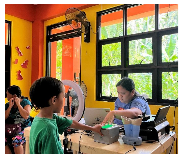
PhilSys Registration Team conducts PhilSys registration of children 1- 4 years old in Brgy. Binunga, Boac, Marinduque

Aside from the registration services, the PhilSys Team facilitated the authentication of ePhilIDs/PhilIDs for DSWD 4Ps beneficiaries and carried out extensive information campaigns on the importance of PhilSys registration. These initiatives elucidated various functionalities of ePhilIDs and PhilIDs, emphasizing how these identification cards can streamline access to government services and facilitate everyday transactions.