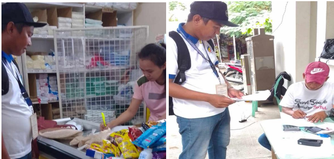
Statistical Researcher gathering prices of a specific basket of goods in sample outlets/establishments.

17 DECEMBER 2024 – MARINDUQUE PROVINCIAL STATISTICAL OFFICE. In a significant move to monitor the inflation, the Philippine Statistics Authority (PSA) PSO Marinduque has successfully concluded its Retail Price Survey (RPS) for December 2024. This data collection exercise is crucial for refining the CPI, which helps to assess inflationary trends and understand price dynamics in the local economy.