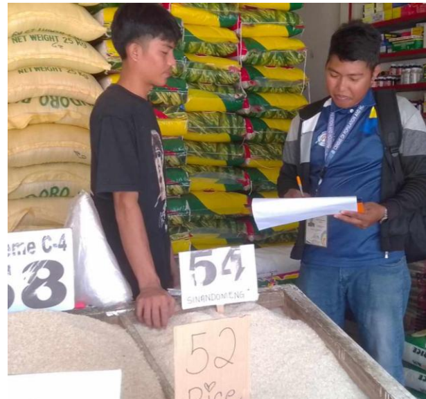
Statistical Researchers gathering prices of a specific basket of goods in sample outlets/establishments.

19 February 2025 – MARINDUQUE PROVINCIAL STATISTICAL OFFICE. Boac, Marinduque – The Philippine Statistics Authority (PSA) PSO Marinduque has successfully completed its February 2025 Retail Price Survey (RPS), reaffirming its role in delivering critical data for economic analysis and inflation tracking.