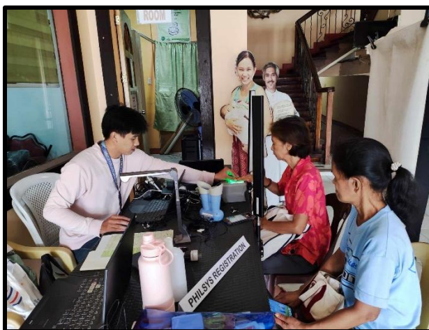
PhilSys Registration Team conducts Step 2 Registration in Business One Stop-Shop situated in the Municipality of Gasan.