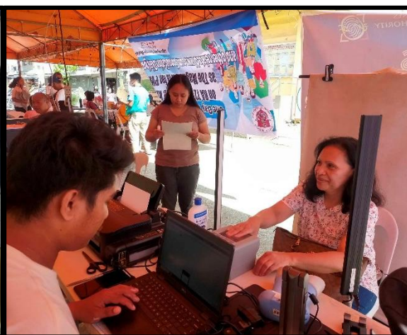
PhilSys Registration Team conducts Step 2 Registration in Business One Stop-Shop situated in the Municipality of Mogpog.

Philippine Statistics Authority (PSA) Marinduque Provincial Statistical Office (PSO) participates in the Business One-Stop Shop (BOSS) program of Local Government Units (LGUs) together with various government agencies, facilitating seamless business establishment processes through a centralized location for business development services.