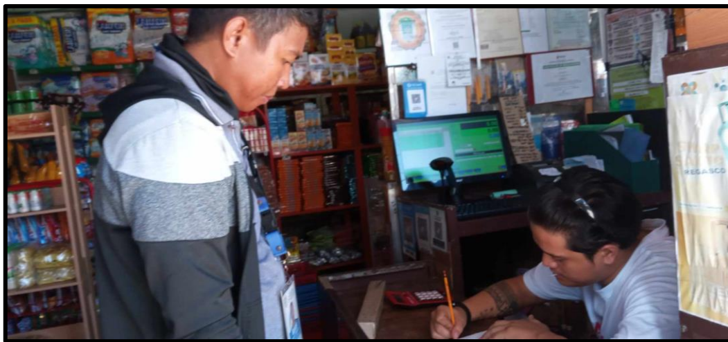
PSA-Marinduque Statistical Researcher gathering prices of a specific basket of goods in sample outlets/establishments.

The Philippine Statistics Authority (PSA) Marinduque Provincial Statistical Office (PSO) recently completed the February 2024 round of the Survey of Retail Prices of Selected Commodities and Services for the Generation of Consumer Price Index (CPI). The survey was conducted in two phases: the first from February 1-5, 2024, and the second from February 15-17, 2024.