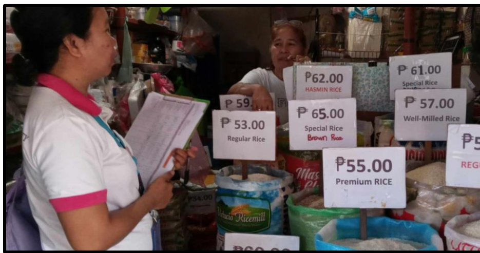
PSA-Marinduque Statistical Researcher gathering prices of a specific basket of goods in sample outlets/establishments.

The Philippine Statistics Authority (PSA) Marinduque Provincial Statistical Office (PSO) recently completed the May 2024 round of the Survey of Retail Prices of Selected Commodities and Services for the Generation of Consumer Price Index (CPI). The survey was conducted in two phases: the first from May 1-5, 2024, and the second from May 15-17, 2024.