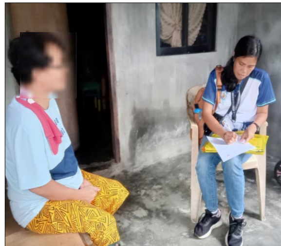
PSO Marinduque's Statistical Researchers conducting interviews with sample households of February 2025 LFS.

MARINDUQUE PROVINCIAL STATISTICAL OFFICE. The Philippine Statistics Authority (PSA) Marinduque Provincial Statistical Office (PSO) is currently conducting the February 2025 Labor Force Survey (LFS), from February 8 - 28, 2025.