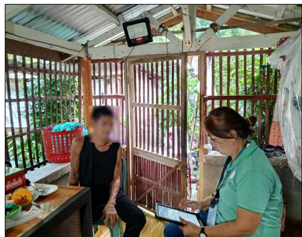
PSA Marinduque SRs conducting interviews with sample palay-farming and corn-farming households of February 2025 MPCRS.

MARINDUQUE PROVINCIAL STATISTICAL OFFICE. The Philippine Statistics Authority (PSA) Marinduque Provincial Statistical Office (PSO) is currently conducting the February 2025 Monthly Palay and Corn Situation Reporting System (MPCRS), from February 1 – 5, 2025.