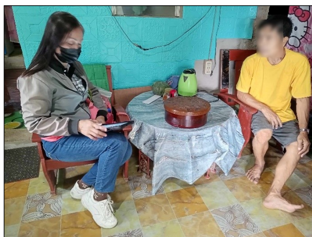
PSA Marinduque SRs conducting interviews with sample palay-farming and corn-farming households of March 2025 MPCRS.

MARINDUQUE PROVINCIAL STATISTICAL OFFICE. The Philippine Statistics Authority (PSA) Marinduque Provincial Statistical Office (PSO) successfully conducted the March 2025 Monthly Palay and Corn Situation Reporting System (MPCRS), from March 1 – 5, 2025.