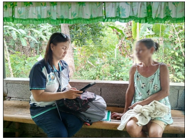
PSA Marinduque SRs conducting interviews with sample palay-farming and corn-farming households of May 2025 MPCSRs.

MARINDUQUE PROVINCIAL STATISTICAL OFFICE. The Philippine Statistics Authority (PSA) Marinduque Provincial Statistical Office (PSO) successfully conducted the May 2025 Monthly Palay and Corn Situation Reporting System (MPCSRs), from May 1 – 5, 2025.