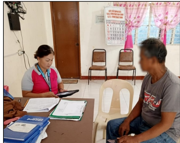
PSA-Marinduque SRs conducting interviews with sample palay- and corn-farming households of November 2024

05 November 2024 – MARINDUQUE PROVINCIAL STATISTICAL OFFICE. The Philippine Statistics Authority (PSA) Marinduque Provincial Statistical Office (PSO) successfully conducted the November 2024 Monthly Palay and Corn Situation Reporting System (MPCSRs). The survey was conducted on November 1 – 5, 2024.