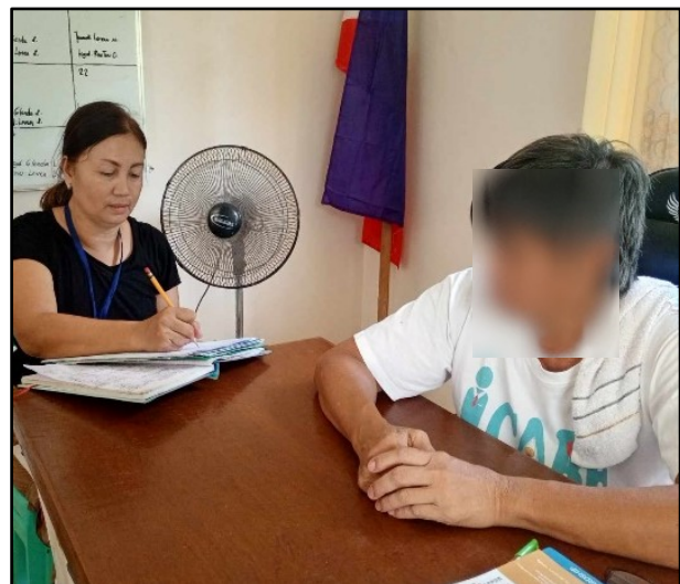
PSA-Marinduque SRs conducting interviews with sample palay- and corn-farming households of September 2024

01 September 2024 – MARINDUQUE PROVINCIAL STATISTICAL OFFICE. The Philippine Statistics Authority (PSA) Marinduque Provincial Statistical Office (PSO) successfully conducted the September 2024 Monthly Palay and Corn Situation Reporting System (MPCSRs). The survey was conducted on September 1 – 5, 2024.