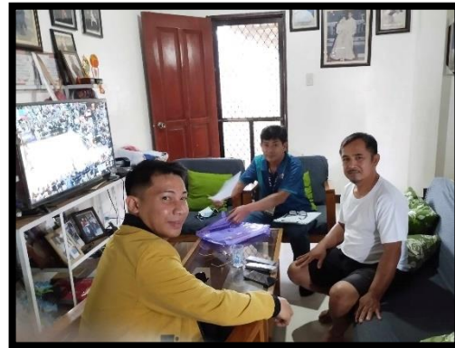
PSA-Marinduque SRs conducting interviews of sample households of the 1 st Quarter 2024 BLPS.

The Philippine Statistics Authority (PSA) Marinduque Provincial Statistical Office (PSO) successfully conducted the 1 st Quarter 2024 Backyard Livestock and Poultry Survey (BLPS) , from 25 March 2024 to 3 April 2024. The PSA's authority and mandate to conduct this survey emanates from Republic Act (RA) 10625, or the Philippine Statistical Act of 2013, which authorizes the PSA to prepare and conduct surveys and periodic censuses on various sectors of the economy.