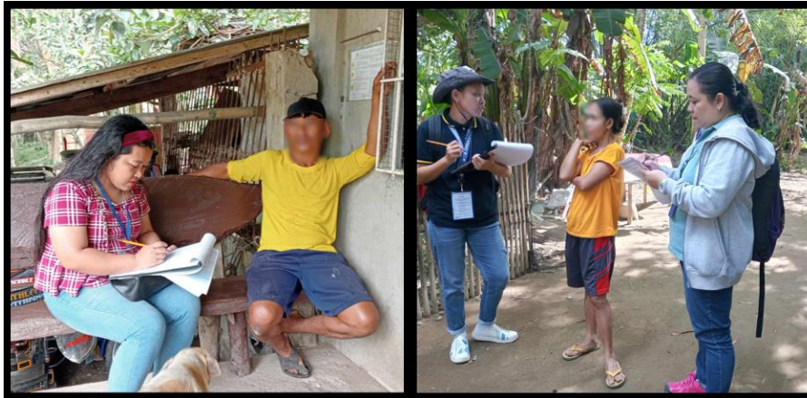
PSA-Marinduque SRs conducting interviews with sample households of February 2024 Enhanced RCSS: H

The Philippine Statistics Authority (PSA) Marinduque Provincial Statistical Office (PSO) have been successfully completed the February 2024 Enhanced Rice and Corn Stocks Survey: Household (RCSS: H) , from 01 to 04 February 2024. The PSA's authority and mandate to conduct this survey emanates from Republic Act (RA) 10625, or the Philippine Statistical Act of 2013, which authorizes the PSA to prepare and conduct surveys and periodic censuses on various sectors of the economy.