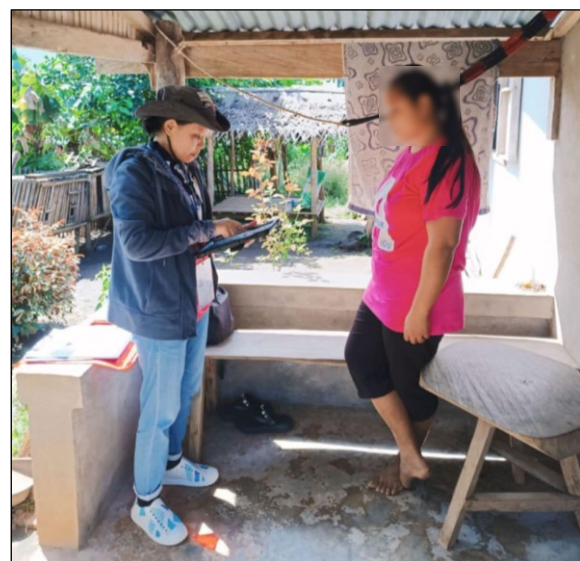
PSA Marinduque SRs conducting interviews with sample establishments/households of February 2025 RCSS:C and RCSS:H

MARINDUQUE PROVINCIAL STATISTICAL OFFICE. The Philippine Statistics Authority (PSA) Marinduque Provincial Statistical Office (PSO) is currently conducting the February 2025 Re-designed Rice and Corn Stocks Survey: Commercial (RCSS: C) and Enhanced Rice and Corn Stocks Survey: Household (RCSS:H), from February 1 – 5, 2025.