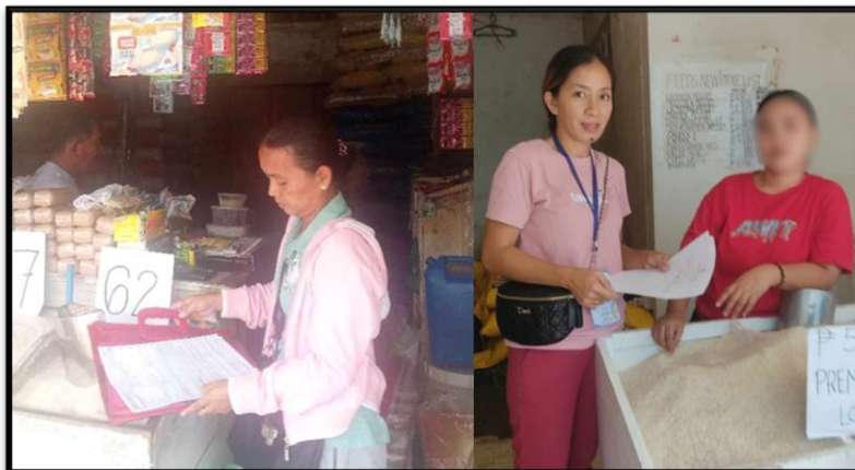
PSA-Marinuque SRs conducting interviews with sample establishments of Re-designed January 2024 RCSS: C

The Philippine Statistics Authority (PSA) Marinduque Provincial Statistical Office (PSO) successfully conducted the January 2024 Re-designed Rice and Corn Stocks Survey: Commercial (RCSS: C) , from 01 to 04 January 2024. The PSA's authority and mandate to conduct this survey emanates from Republic Act (RA) 10625, or the Philippine Statistical Act of 2013, which authorizes the PSA to prepare and conduct surveys and periodic censuses on various sectors of the economy.