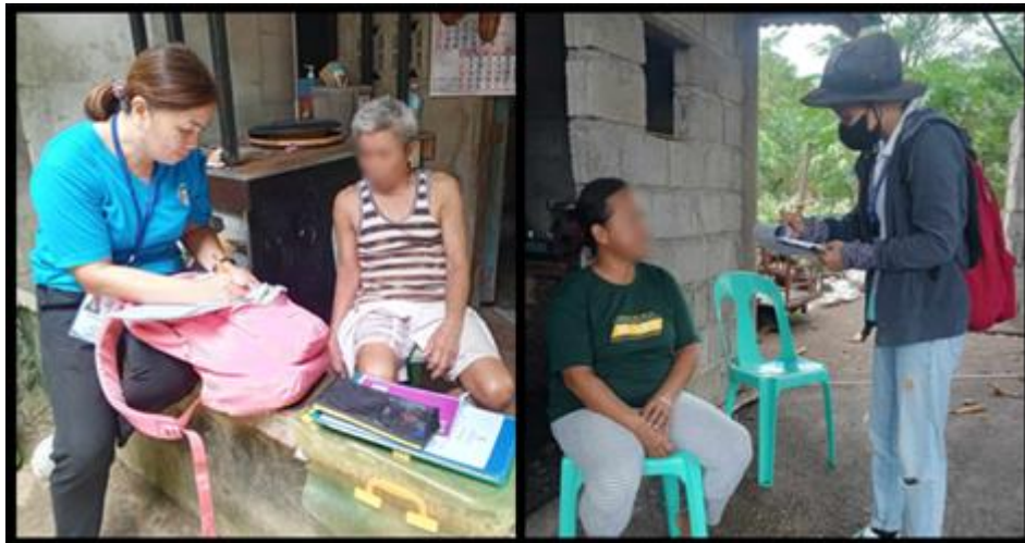
PSA-Marinduque SRs conducting interviews with sample households of January 2024 Enhanced RCSS: H

The Philippine Statistics Authority (PSA) Marinduque Provincial Statistical Office (PSO) successfully conducted the January 2024 Enhanced Rice and Corn Stocks Survey: Household (RCSS: H) , from 01 to 04 January 2024. The PSA's authority and mandate to conduct this survey emanates from Republic Act (RA) 10625, or the Philippine Statistical Act of 2013, which authorizes the PSA to prepare and conduct surveys and periodic censuses on various sectors of the economy.