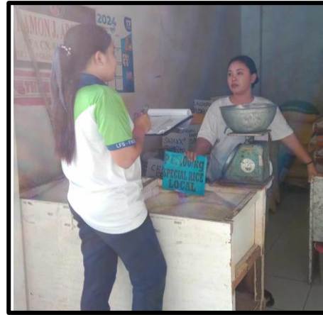
PSA-Marinduque SRs conducting interviews with sample establishments of Re-designed May 2024 RCSS: C

The Philippine Statistics Authority (PSA) Marinduque Provincial Statistical Office (PSO) successfully conducted the May 2024 Re-designed Rice and Corn Stocks Survey: Commercial (RCSS: C) , from 01 to 04 May 2024. The PSA's authority and mandate to conduct this survey emanates from Republic Act (RA) 10625, or the Philippine Statistical Act of 2013, which authorizes the PSA to prepare and conduct surveys and periodic censuses on various sectors of the economy.