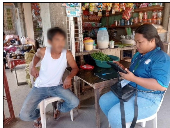
PSA-Marinduque SRs conducting interviews with sample household of October 2024 Enhanced RCSS: H

06 October 2024 – MARINDUQUE PROVINCIAL STATISTICAL OFFICE. The Philippine Statistics Authority (PSA) Marinduque Provincial Statistical Office (PSO) successfully conducted the October 2024 Enhanced Rice and Corn Stocks Survey: Household (RCSS: H). The survey was conducted on 01 October 2024 to 06 October 2024.