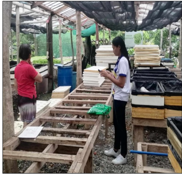
PSA-Marinduque SRs conducting interviews of respondents from sample households and establishments of Second Quarter 2025 Crops Production Survey (CrPS)

JUNE 2025 MARINDUQUE PROVINCIAL STATISTICAL OFFICE. The Philippine Statistics Authority (PSA) Marinduque Provincial Statistical Office (PSO) successfully conducted the Second Quarter 2025 Crops Production Survey (Households and Establishments) , for ten days covering the period June 14 - 24, 2025, including Saturdays and Sundays.