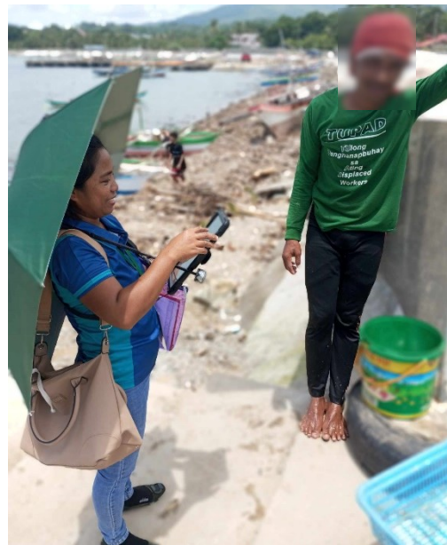
PSA-Marinduque SRs conducting interviews of sample qualified fisherfolks of Third Quarter 2024 QCFS.

27 September 2024 – MARINDUQUE PROVINCIAL STATISTICAL OFFICE. The Philippine Statistics Authority (PSA) Marinduque Provincial Statistical Office (PSO) successfully conducted the Third Quarter 2024 Commercial Fisheries Survey (QCFS) , from July 1, 2024 to September 27, 2024.