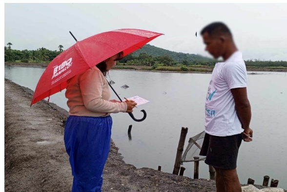
PSA-Marinduque SRs conducting interviews of sample aquafarm owners/operators of 3rd Quarter 2024 QAQS

07 September 2024 – MARINDUQUE PROVINCIAL STATISTICAL OFFICE. The Philippine Statistics Authority (PSA) Marinduque Provincial Statistical Office (PSO) successfully conducted the Third Quarter 2024 Aquaculture Fisheries Survey (QAQS) , from September 7 – 10, 2024. The PSA's authority and mandate to conduct this survey emanates from Republic Act 10625, or the Philippine Statistical Act of 2013, which authorizes the PSA to prepare and conduct surveys and periodic censuses on various sectors of the economy.