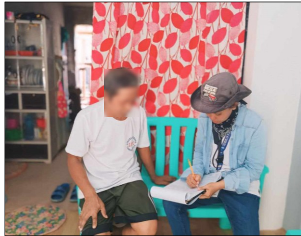
PSA-Marinduque SRs conducting interviews of sample inland fishing households for the 3 RD Quarter 2024 QIFS.

07 September 2024 – MARINDUQUE PROVINCIAL STATISTICAL OFFICE. The Philippine Statistics Authority (PSA) Marinduque Provincial Statistical Office (PSO) successfully conducted the Third Quarter 2024 Inland Fisheries Survey (QIFS) , from September 7 – 10, 2024. The PSA's authority and mandate to conduct this survey emanates from Republic Act 10625, or the Philippine Statistical Act of 2013, which authorizes the PSA to prepare and conduct surveys and periodic censuses on various sectors of the economy.