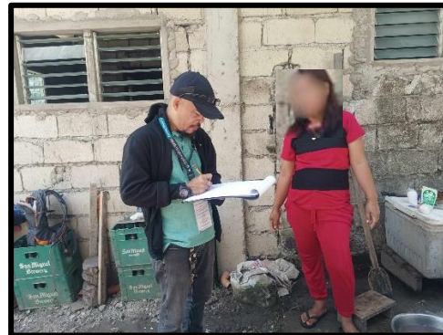
PSA-Marinduque SRs conducting interviews of sample aquafarm owners/operators of 1 st Quarter 2024 QAQS

The Philippine Statistics Authority (PSA) Marinduque Provincial Statistical Office (PSO) successfully conducted the First Quarter 2024 Aquaculture Fisheries Survey (QAQS) , from 13 to 17 March 2024. The PSA's authority and mandate to conduct this survey emanates from Republic Act (RA) 10625, or the Philippine Statistical Act of 2013, which authorizes the PSA to prepare and conduct surveys and periodic censuses on various sectors of the economy.