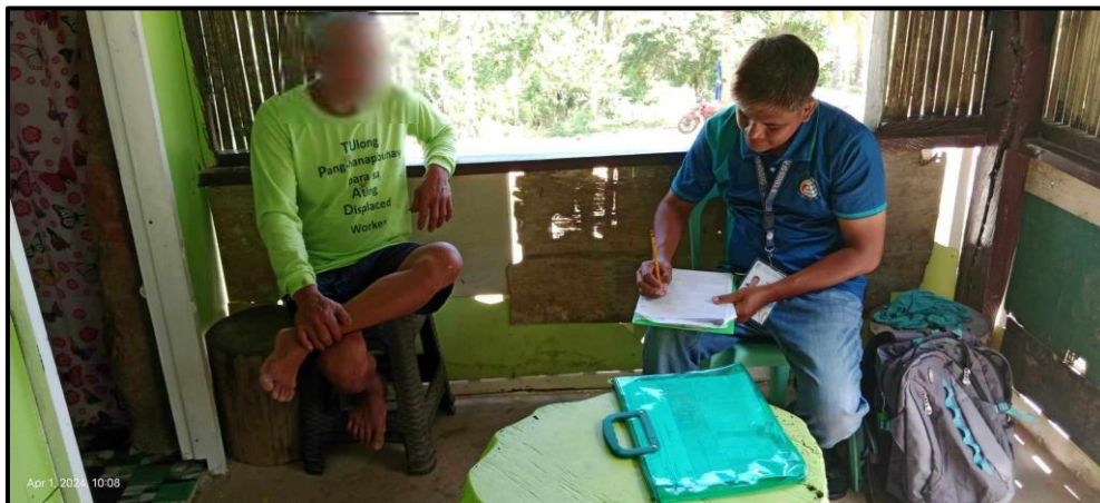
PSA-Marinduque SR conducting interviews of sample inland fishing households for the 1 ST Quarter 2024 QIFS.

The Philippine Statistics Authority (PSA) Marinduque Provincial Statistical Office (PSO) is successfully conducted the First Quarter 2024 Inland Fisheries Survey (QIFS) , from 12 to 17 March 2024. The PSA's authority and mandate to conduct this survey emanates from Republic Act (RA) 10625, or the Philippine Statistical Act of 2013, which authorizes the PSA to prepare and conduct surveys and periodic censuses on various sectors of the economy.