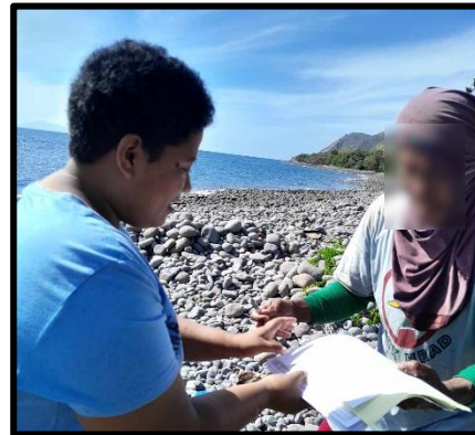
PSA-Marinduque SRs conducting interviews of sample qualified fisherfolks of First Quarter 2024 QMFS.

The Philippine Statistics Authority (PSA) Marinduque Provincial Statistical Office (PSO) is currently conducting the First Quarter 2024 Municipal Fisheries Survey (QMFS) , from 02 January 2024 to 30 March 2024. The PSA's authority and mandate to conduct this survey emanates from Republic Act (RA) 10625, or the Philippine Statistical Act of 2013, which authorizes the PSA to prepare and conduct surveys and periodic censuses on various sectors of the economy.