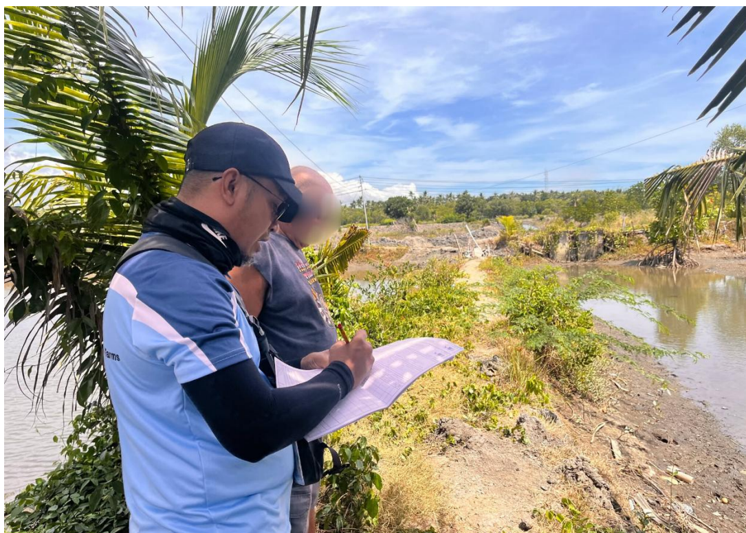
PSA Statistical Researcher conducting an interview with the respondent of the Quarterly Aquaculture Survey (QAqS).

09 June 2025 – CALAPAN CITY, ORIENTAL MINDORO. The Philippine Statistics Authority (PSA), Oriental Mindoro will conduct the Quarterly Inland Fisheries Survey (QIFS) and Quarterly Aquaculture Fisheries Survey (QAqS) for the Second Quarter of 2025. A total of seven Statistical Researchers (SRs) will be involved in the collection of data from 16 to 27 June 2025.