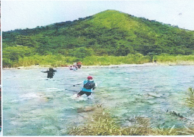
PSA Occidental Mindoro field personnel during the conduct of 2024 POPCEN-CBMS enumeration

The Philippine Statistics Authority – Occidental Mindoro is continuously conducting the data collection of the 2024 POPCEN-CBMS across the province. Field personnel in the province of Occidental Mindoro are currently doing the house to house enumeration at far-flung areas despite the bad weather condition brought by typhoon Enteng from 02 – 06 September 2024.