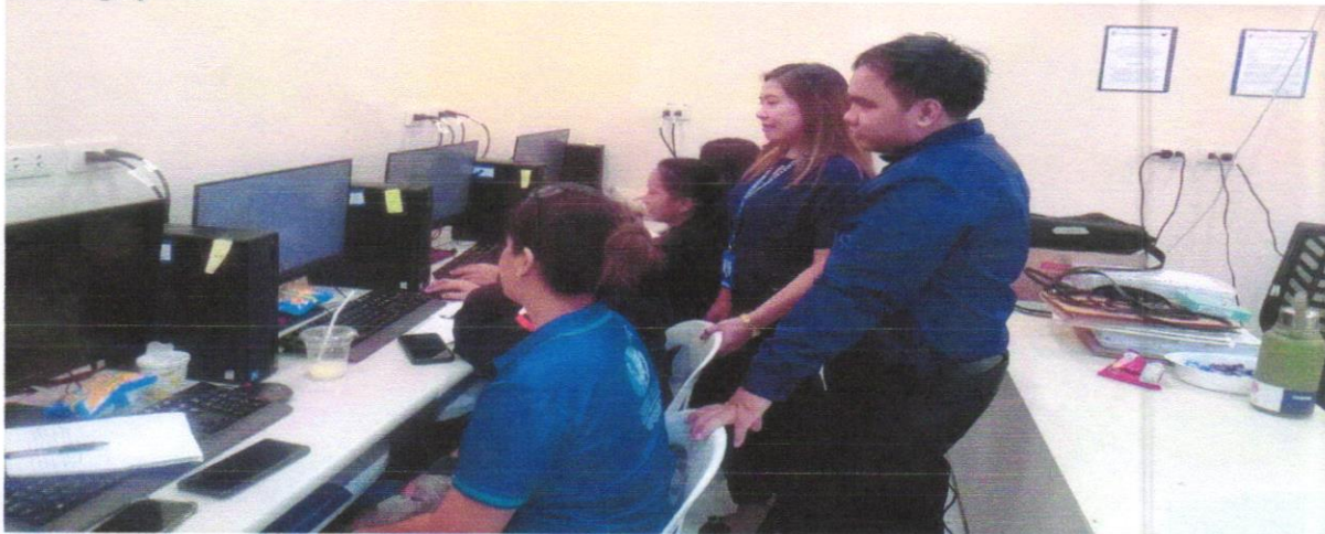
Map Data Processors and Map Data Reviewer conducting hands-on training on map generation and processing.

This activity involves the use of mapping technology to collect precise geographic data on service facilities, including health centers, schools and government infrastructure project. This geotagging activity is critical in providing policymakers with accurate, up-to-date information on the distribution and accessibility of essential services across all barangays.