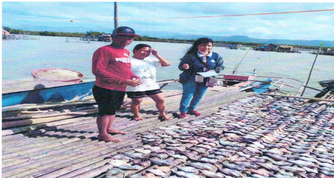
Statistical Researchers during the Conduct of Fisheries Survey in Occidental Mindoro.

Date of Release: 19 March 2025 Reference No.: 2025PR-45