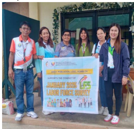
In frame, barangay officials from Poblacion, Looc (left photo) and Azagra, San Fernando, expressing their support to the conduct of January 2025 Labor Force Survey.

Utilizing the 2023 Geo-Enabled Master Sample for Household-based Surveys, the survey has a total of 100 sample households for the province to ensure reliable estimates of the labor and employment indicators. These