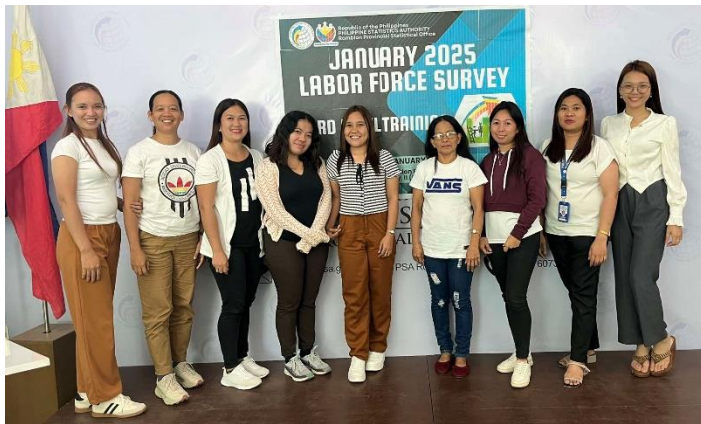
SRs and trainers during the Third Level Training on January 2025 Labor Force Survey.

The LFS is a nationwide survey conducted by the PSA to gather data on the demographic and socio-economic characteristics of the population. The results of the survey will provide high frequency statistical information on the nation's labor market and better understanding on the current situation of employment and economy of the Philippines.