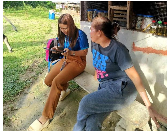
SR Mesana as she interviews sample household in Brgy. Agojo, Looc, Romblon.

15 January 2025. ROMBLON, ROMBLON. The Philippine Statistics Authority (PSA) – Romblon Provincial Statistical Office is currently conducting the January 2025 Labor Force Survey to 387 sample households in the province. Seven (7) Statistical Researchers (SRs) were trained during the Third Level Training conducted last January 2-3 and 6-7, 2024, which are involved in the data collection on January 08-31, 2024 in selected municipalities of the province.