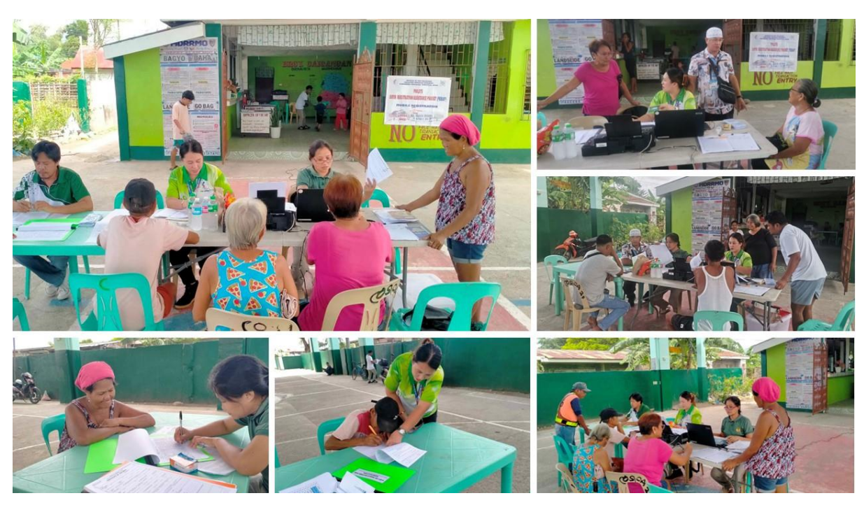
BRC Matining, along with Buenavista MCR Milambiling and staff, conducted BRAP Mobile Registration Services, in Barangay Caigangan, Buenavista, on 17 October 2024.

Date of Release: 28 October 2024 Reference No.: 2024PR-10-150